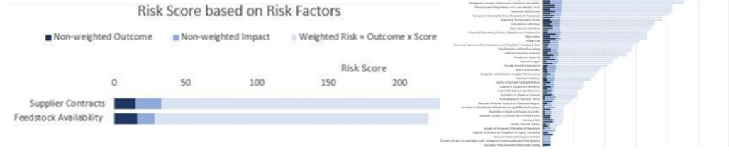
Figure 2 - Risk Indicators (sorted numerically)