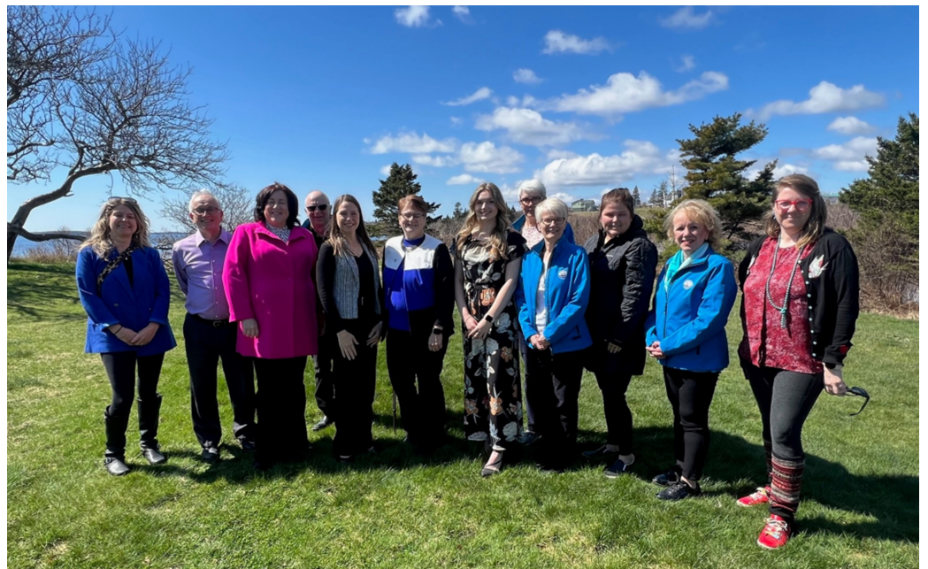
Community members and Council celebrate the LaHave River Straight Pipe Replacement Program completion.

Our Municipal Council has been an advocate for point of sale legislation and I look forward to working with the Provincial government to make it a reality.