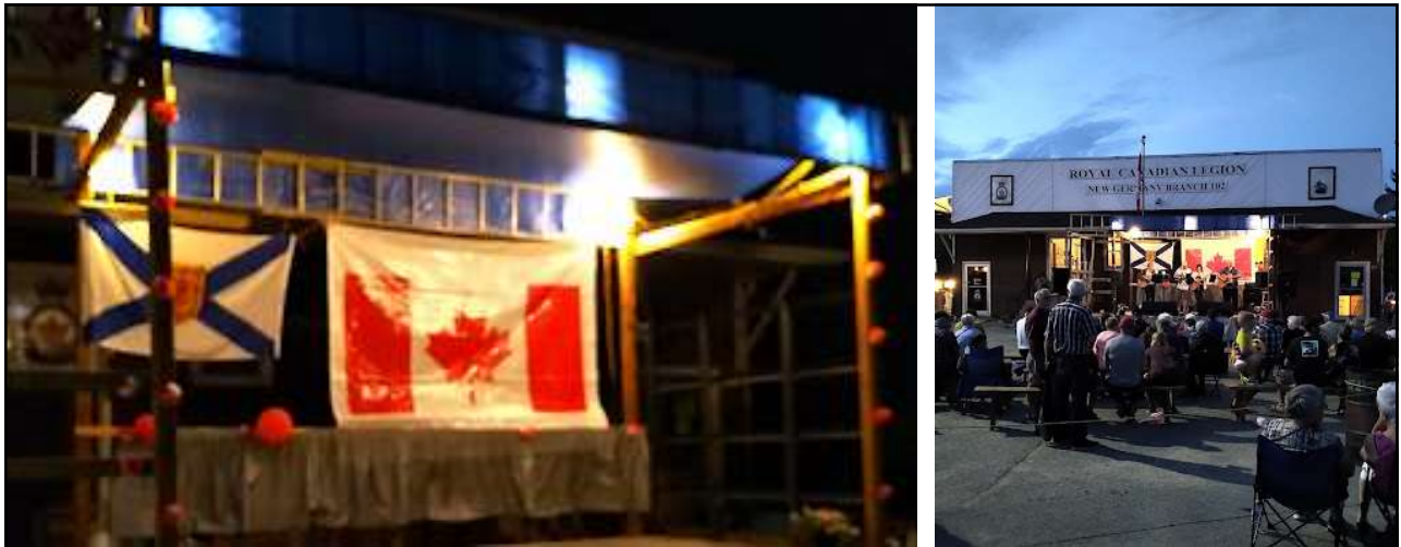
Events at Legion