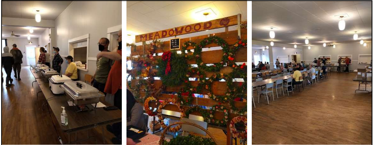
Events at Legion